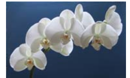
Phal Kirifuri Paper Moon

I have also personally seen Dendrobium weevils hiding in the sphagnum moss and then climb up the flower stems to chew on the flowers. US growers were asked by the U.S.D.A. for comments and opinions about allowing plants from Taiwan into the US with the potting mix (moss) still on the roots and in pots. US growers all voiced their opposition to this idea but we were brushed aside as what this was really about was a reciprocal trade deal made during the Clinton era. The Hawaiian growers tried to sue the government but they made a mistake and sued them in Washington D.C. where things have a habit of being tilted in the Government's favor. It would have been better to sue in Hawaii. The Hawaiians then decided to impose a ban on plants arriving in Hawaii in moss and in pots but the USDA forced their hand and told them they couldn't impose a State rule over a Federal rule regarding national Agricultural commerce. I would suggest that any serious hobbyist or commercial grower either isolate new plants for a time and treat them to prevent a tragic loss of beloved stock that is sometimes irreplaceable.