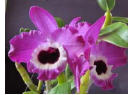
Den. nobile 'Star Sapphire'

General meetings are held at the Garth Homer Centre, 813 Darwin Ave., Victoria B.C., on the fourth Tuesday of the month. Members are encouraged to bring in their orchids in bloom to display on the show table. They will be photographed and posted on our website.