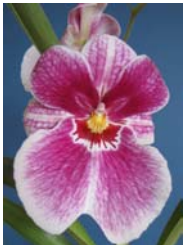
Mps. Mrs. Anneli Loeb x endresii