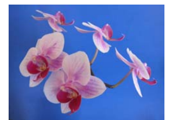
Phal Brother Spring Dancer ‘Little Angel’