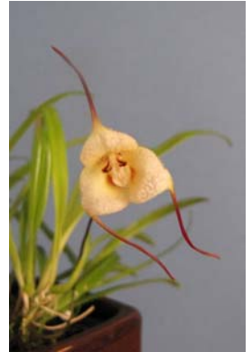
Dracula lotax 'Popcorn'