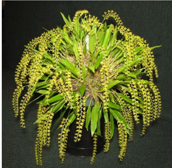
This massive Dendrochilum formosanum grown by Don Mills was chosen as best plant on the display table at the January meeting.

Meetings:2010 February 22 March 22 April 26 May 24 June 28