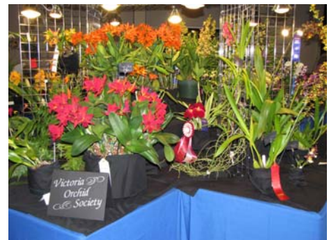
VicOS display, spring 2010