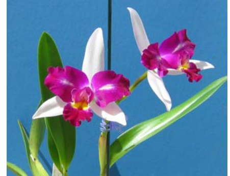
Rsc Hwa Yuan Beauty 'Frances'