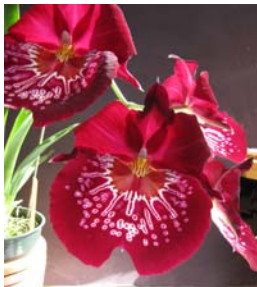
Mps Mario van Peebles

Goodies for the February meeting are requested from those members with last names beginning with L & M.