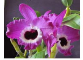
Den. nobile 'Star Sapphire'

General meetings are held at the Garth Homer Centre, 813 Darwin Ave., Victoria B.C., on the fourth Tuesday of the month. Members are encouraged to bring in their orchids in bloom to display on the show table. They will be photographed and posted on our website.