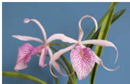
Blc. Morning Glory 'Remar' HCC/AOS