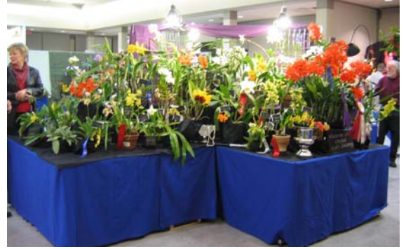
VicOS display at the 2009 spring show

We are very optimistic about the upcoming show. We have more vendors than usual, including Norito Hasegawa from L.A. (Paphanatics). We will be selling (on consignment) plants from Ecuagenera, GoldenGate Orchids (from San Francisco), and locally, we are very lucky to have pleiones donated by Linda Dowling (Happy Valley Lavender Farm).