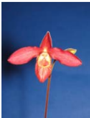
Phrag. Andean Fire