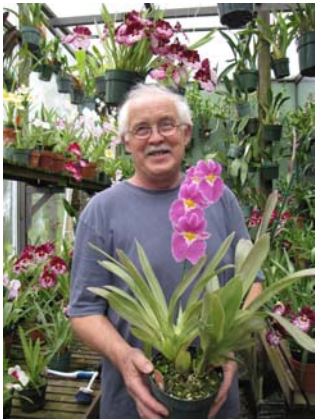
Mps. vexillaria 'Poul's Super Oscuro' AM/AOS

Awarded seedlings that resulted from my own flasking: