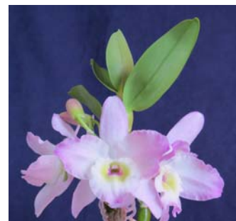
Den. Himezakura 'Fujikko'