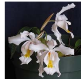
Victoria Orchid Society Minutes of General Meeting January 28 th , 2014