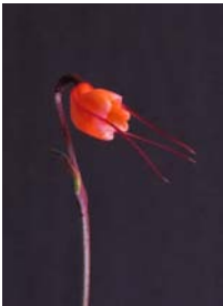
Dracula sodiroi 'Fuzzy Bell'

Members with last names starting with S, T, & V are asked to bring goodies for the February meeting.