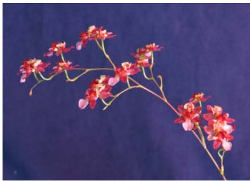
Oncidium Twinkle Westen ( cheiroporum x ornithorhynchum )