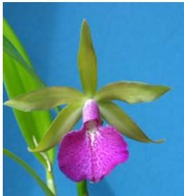
Blc. Mem Vida Lee 'Limelight'