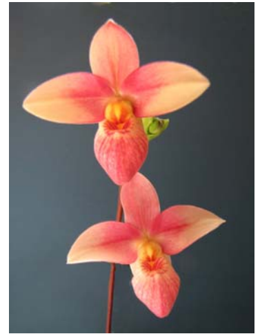
Phrag Hanne Popow (schlimii ‘Pink Delight’ x besseae ‘Inca Fire’)

Getting your plant collections organized for shows may involve the need for re-potting materials, fancy pots, or “special” orchids to add to your collection. Take advantage of the 10% discount given to Victoria Orchid Society Members on the purchase of regularly priced items by these various establishments. You will have to show your current VicOS membership card to receive the discount at most places.