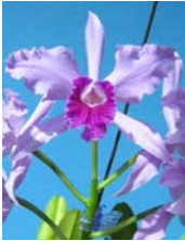
L. lobata 'Fiesta' x L. Boa Vista

Laelia lobata has the reputation of being a shy bloomer, but I have not found this to be true. It does like a good amount of sun and should be placed in the sunniest location in the greenhouse, although it should not receive so much sun that the leaves turn excessively yellow in color. The normal light-green leaf color recommended for all Cattleyas is fine, along with normal Cattleya temperatures of 58 F (14. C) night and 85 F (29.5 C) day.