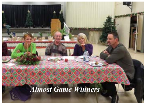
Almost Game Winners