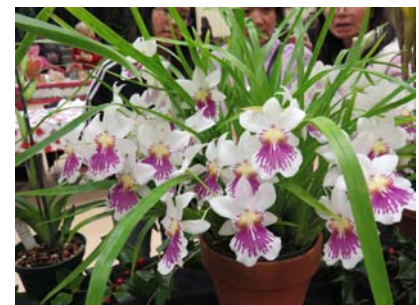
Beautiful display plants