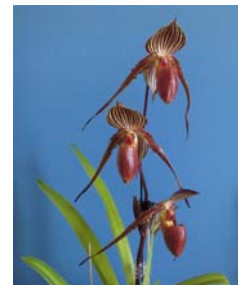
Paph. Susan Booth