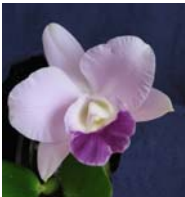
Lc. Mini Purple 'Blue Pacific'