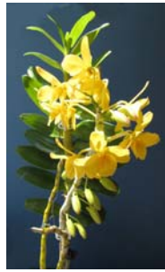
Den. nobile 'Yellow Ribbon Delight'