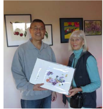
Prize Draw donations

We welcome him as a valuable new member to the Orchid Society.