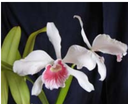
L. purpurata var. carnea 'Old Aunties'

Laelia lobata is a tough plant. It is quite resistant to rotting and will take a lot of cultural abuse, but if you take care of it, it will reward you with a reliable production of four or five flowers every year. It normally flowers in April and May in the United States and will stay in bloom about a month.