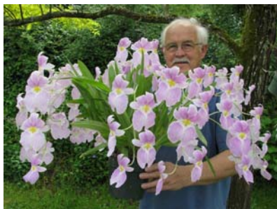
▲ Mps. vexillaria 'Volunteer Park' CCE/AOS, 91 pts, 84 flowers and 5 buds

Members with last names starting with F, G, & H are asked to bring goodies for the June meeting.