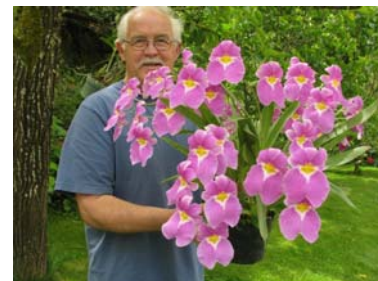
▲ Mps. vexillaria 'Poul's Super Oscuro' AM/AOS, CCM/AOS, 86 pts, 44 flowers and 11 buds

Also, Mps. Kennie 'Diana' HCC/AOS, 76 pts. Venus x vexillaria, 30 flowers and 32 buds