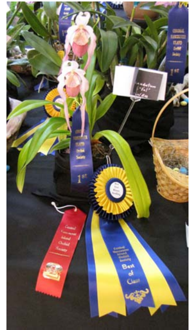
Shirley Page's Phrag Saundersianum Bull HCC/AOS – Trophy for best First Bloom Seedling