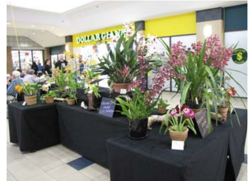
An elegant display