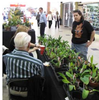
But few customers