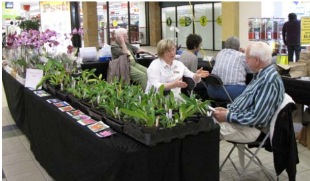
Beautiful plants for sale

The Tillicum Centre Show & Sale unfortunately fell on the first good weekend of the spring and everyone must have been in their gardens. Traffic was very slow and the hardy volunteers generally outnumbered the customers.