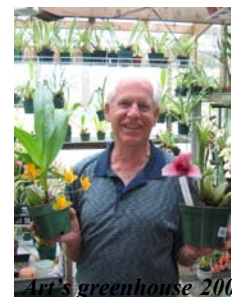
Art's greenhouse 2009

We are looking for member's with greenhouses or sun rooms to host open houses this summer. Such events allow members to see all different kinds of growing situations for orchids.