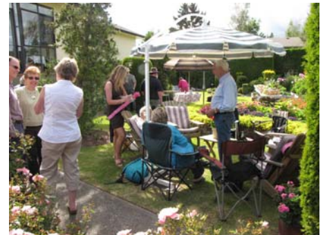
2010 BBQ group in Florence's lovely garden

This year's barbecue will offer Hamburgers, Hot Dogs, Buns, Chili, Potato Salad, fresh fruit, Pavlova, tea and coffee. Please arrive at 4:00 PM, and be prepared to eat 5:00 PM (August days are getting shorter).