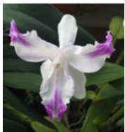
C. intermedia acquiaii