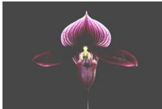
Paphiopedilum Hsinying Carlos 'Lava Glow' FCC/AOS (90 points),

Members with last names starting with C, D, & E are asked to bring goodies for the May meeting.