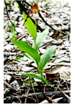
Cypripedium montanum (mountain lady's-slipper)