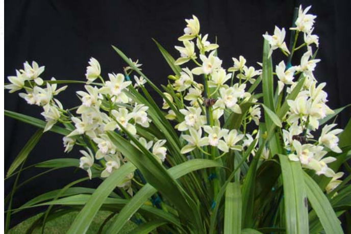
The magnificent Cymbidium Music Box Dancer, grown by Svend Munkholm was voted the best plant on the display table at the April meeting.