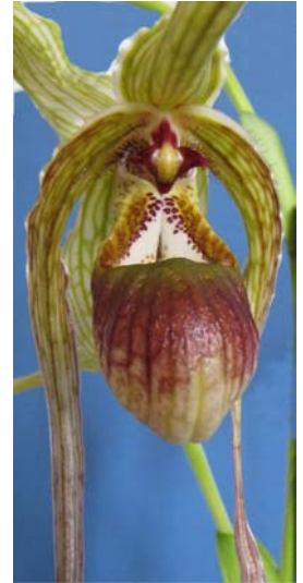
Phrag. caudatum var. fortuna