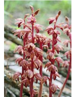
Corallorhiza striata var. striata (striped coralroot)