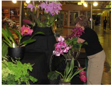
Carefully placed plants