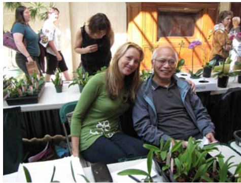
Happy in their work