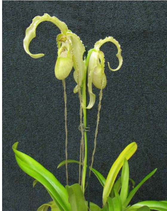
Shirley Page's Phragmipedium 'Court Jester' was chosen as best plant on the display table at the September meeting.