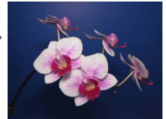
Phal Brother Spring Dancer 'Little Angel'

The Society's mailing Address is 1199 Tattersall Drive, Victoria, B.C. V8P 1Y8.