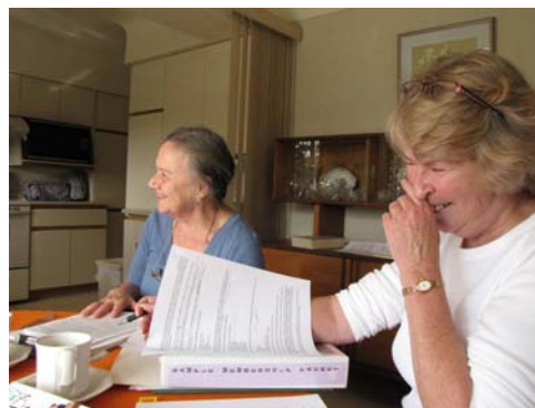
A lighter moment during Constitution and By-law revisions meeting