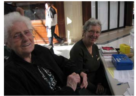
The Welcoming Committee