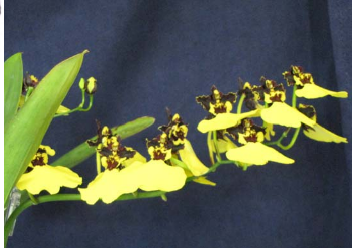
Rick Rancourt's beautiful Onc. Moon Shadow was voted first choice on the display table at the September general meeting.

Meetings: Fall 2012 Oct. 23 Nov. 27 Dec.11 Xmas party