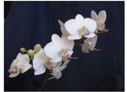
Dtps. Hatsuyuki Nagoriyuki