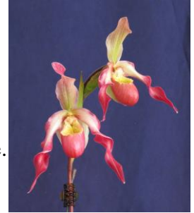
Phragmipedium Joan Montmorency