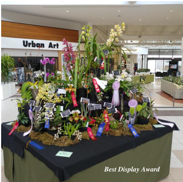
Best Display Award

The following awards were won by VicOS members: