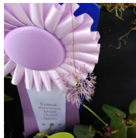
Best of All Others Macrolinium manabinum Leda Bower