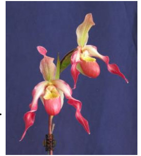
Phragmipedium Joan Montmorency