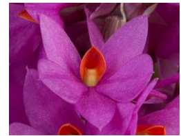
Den. Hibiki 'Paulwela' AM/AOS