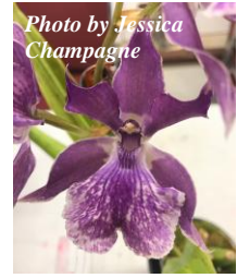
Zygonisia Roquebrune x Acacallis cyanea

The Illustrated Encyclopedia of ORCHIDS , Published 1992 by Timber Press. 304 pages, hundreds of photos.