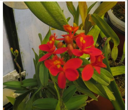
Epidendrum Joseph Lii 'Kultana'