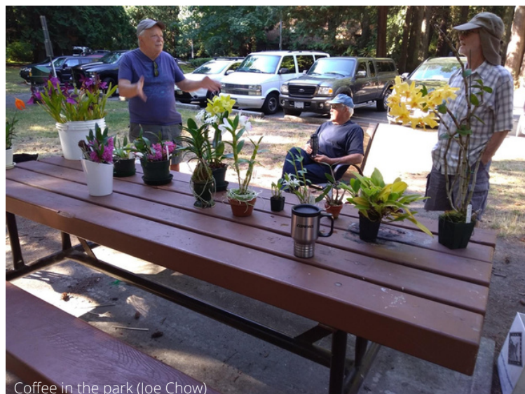
Coffee in the park (Joe Chow)