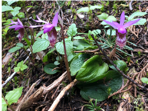
Calypso bulbosa var. occidentalis