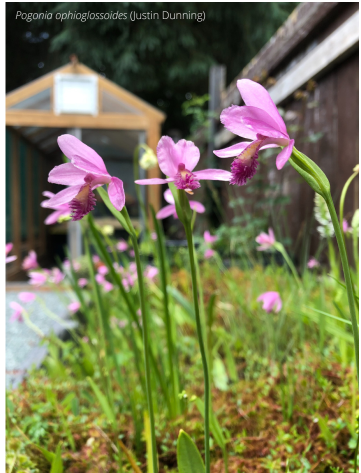
Pogonia ophioglossoides