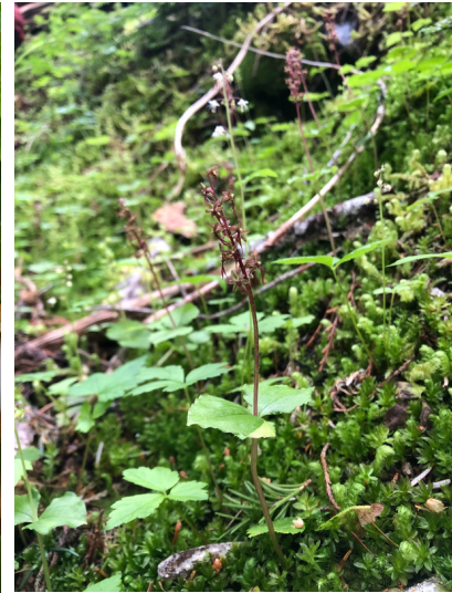
Neottia cordata