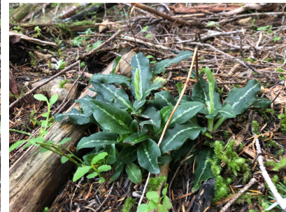
Goodyera oblongifolia